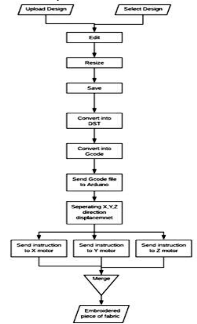
FIGURE 1: Basic Workflow Design

Our research's main process is to turn an old sewing machine into an embroidery machine with user-interactive software that accepts various input files and converts them to a computerized embroidery file. Create and update an SVG image and transform it into a digital embroidery file compatible with the machine [5]. Upload the proper format file via USB, Bluetooth, or Wi-Fi, and place the appropriate hoop. Fabric stabilizing, placing hoops, placing and changing the ribbon, take-up lever, oiling, and bobbin winding are some of the works to be done manually [6]. Among these, the embroidery and frame movement is the most important since they finished the embroidery independently and harmoniously. The wheel pushes the needle and thread in the Z direction to move up and down, and the frame reciprocates in the X and Y directions to produce a beautiful embroidered work.