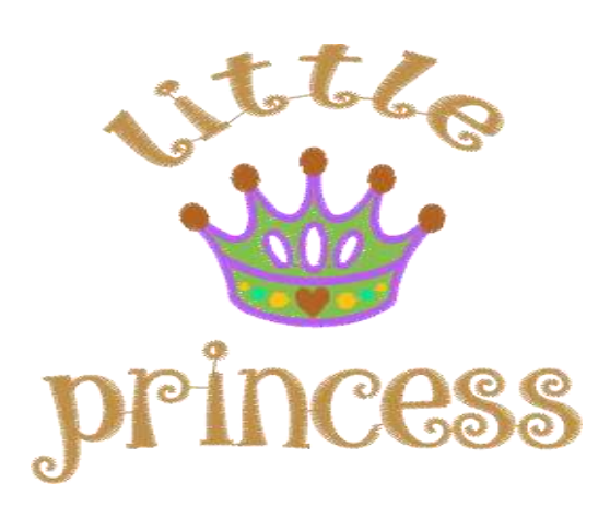
FIGURE 4: DST Embroidery File

Our machine moves in three directions, like a 3D printer, using x-y commands to move back and forth and z commands to move up and down [24].