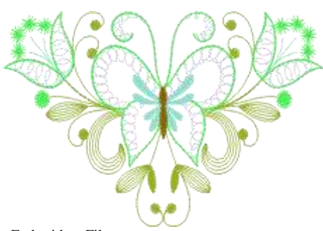
FIGURE 5: Brother Embroidery File

The third component is a Scalable Vector Graphic (SVG) image (see Fig. 6). Clean lines, flat colours, and uniform sterility are all hallmarks of vector drawings. This file is scalable and may be viewed from any location at any time. It's easy to alter and resize images to any extent beyond the drop of detail. Our SVG Draw Bot provides best practices for delivering high-quality outputs in real-time and robust animation features for automatically transforming vector image files into editable forms and drawing vector images using pen and pencil tools. This input file may be turned into a machine-readable file, which can then be translated to Gcode.